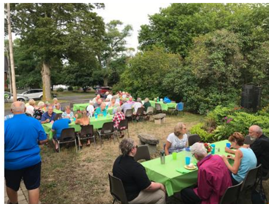
Pork & Corn Roast, 2019-08-25