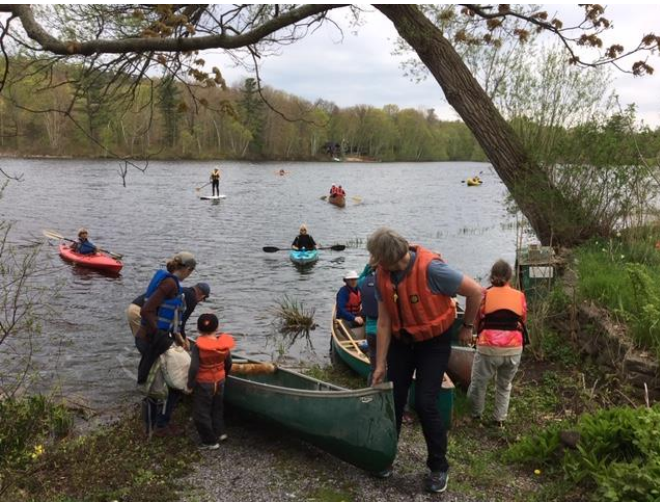
SP Black River Canoe Trip 2019-05-20