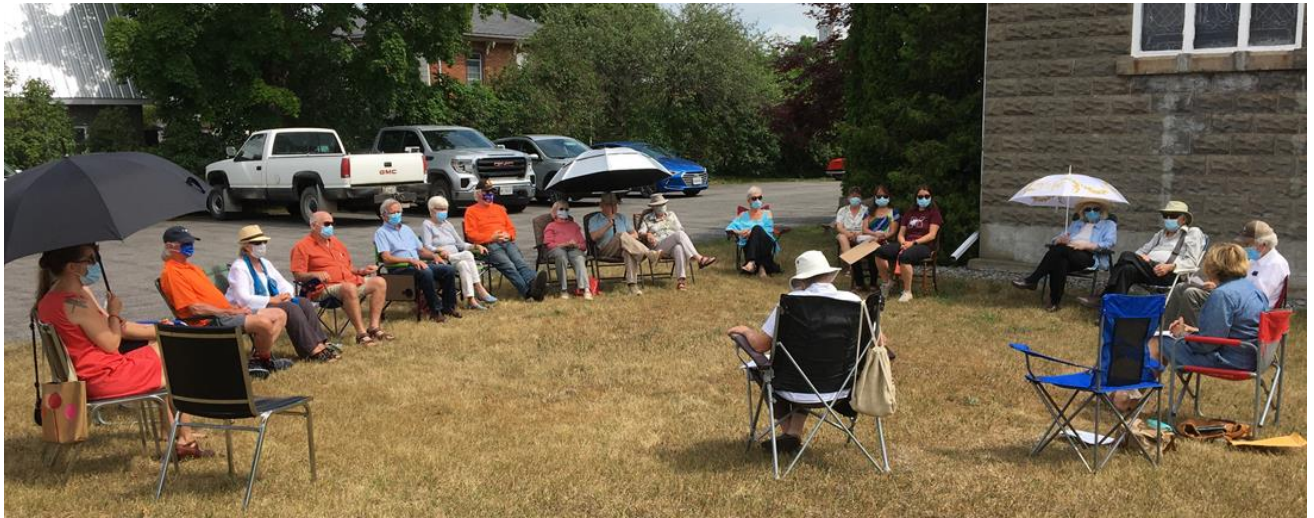
1 July: Canada Day celebration – Focus on Reconciliation