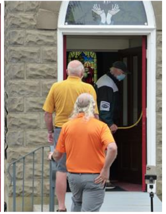
June 18: National Indigenous Peoples Day and Reconciliation service