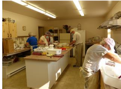
4 Aug: Pork and Corn Roast – COVID style