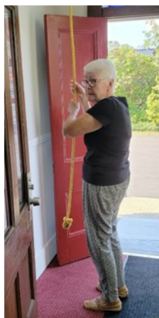
Tolling the St. Philip's bell for the Queen Sept 09